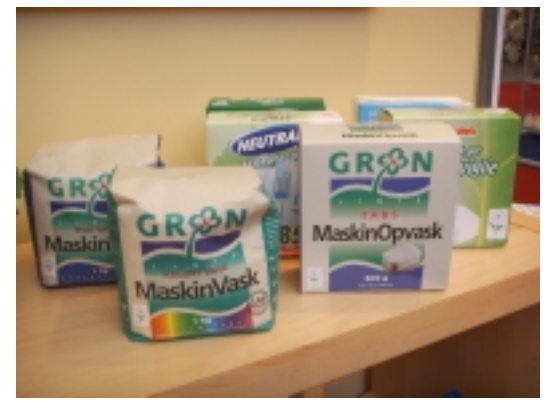
The Flower corner on Danlind stand