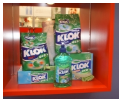
The Flower corner on Dalli Benelux stand