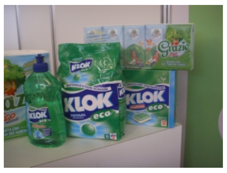
Samples of EU eco-labelled products available on the stand