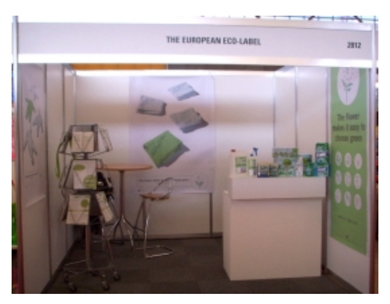
the Flower stand