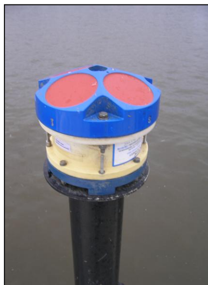
Fig.3 Current meter WHM300 ADCP-I-UG1